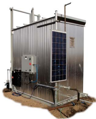
Zero Emission Prototype Separator 2009