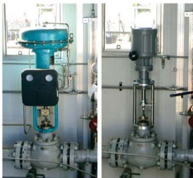
Traditional Methane Powered Actuator